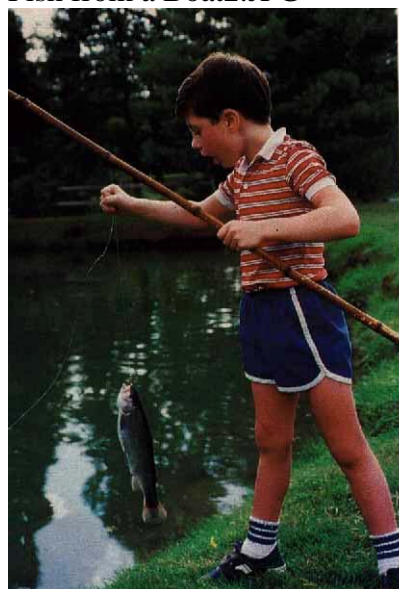
Fishing off Dock TOXFISX.JPG

Davidson River Outfitters 828-877-4181 Headwaters Outfitters 828-877-3106 Morgan Mill Trout Fishing 828-884-6823