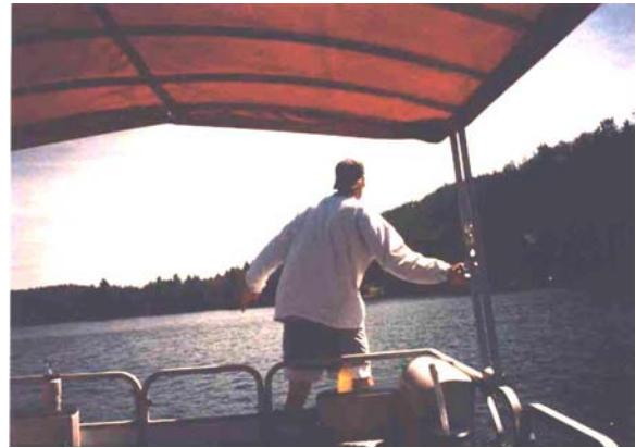
Fish from a Boat2.JPG