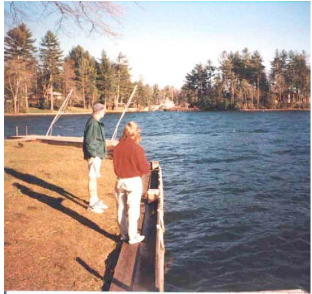
Fish Right Off Dock TOXFISH1.JPG