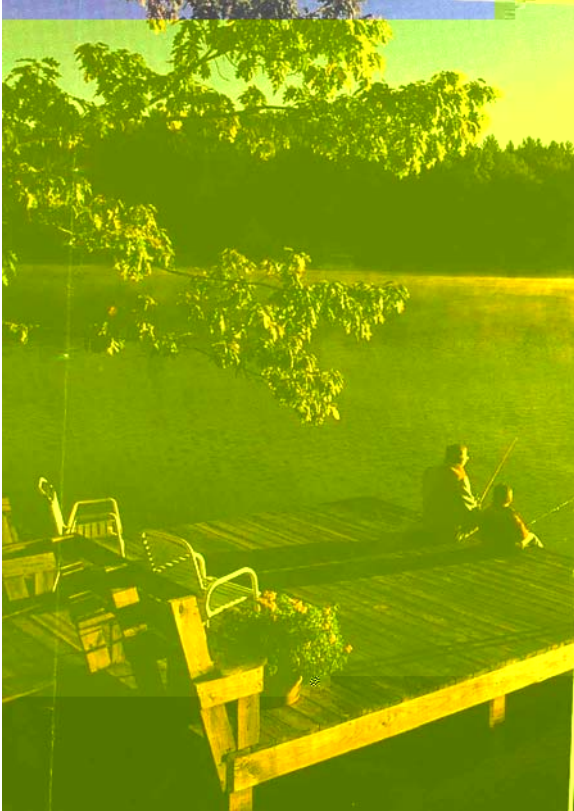
Fish Right Off Dock FISHN.JPG