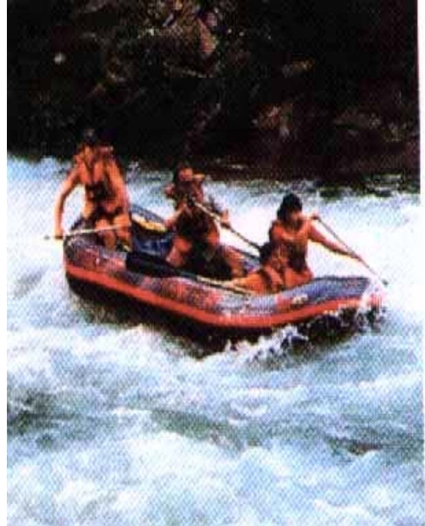
Go whitewater rafting TOXRRAFT1.JPG

Headwater Outfitters 5 miles Rossman NC 828-877-3106