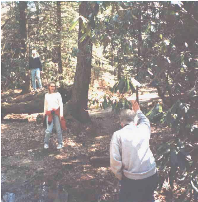
Special Nature Hike near Cardinal Lake 3 miles from Lakefront Mountain Retreat HIKE2.JPG