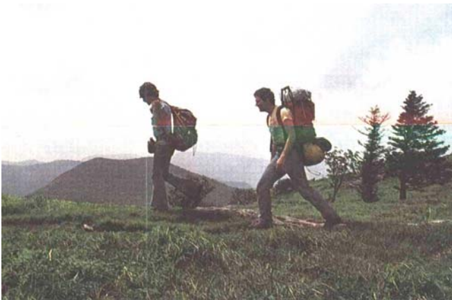
Hiking in Pisgah Forest near Brevard NC 18 miles From Lakefront Mountain Retreat TOXHIKEZ.JPG