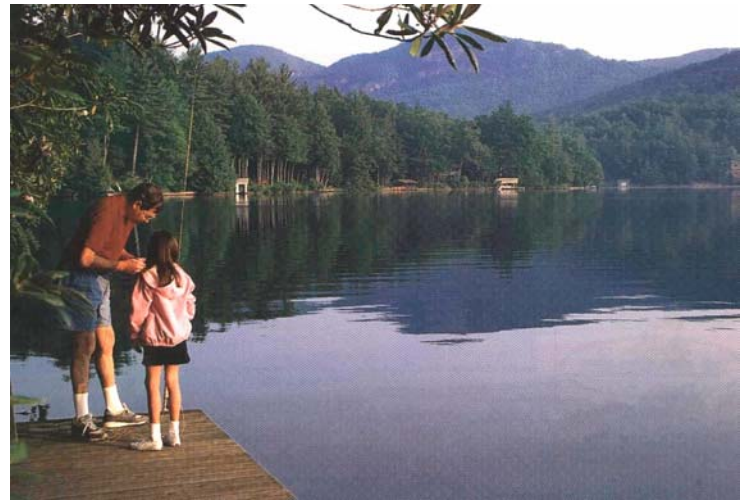
Fishing at Toxaway Lake NC TXFISHTC.JPG